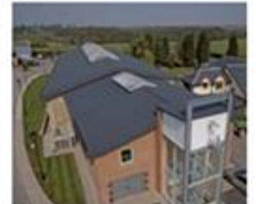
Below and right: Carnwood Park, Leeds. Meta-SlatePlus roofing system with barrel rooflights to a new building during and after installation with view from inside showing underside of AS35 panel.