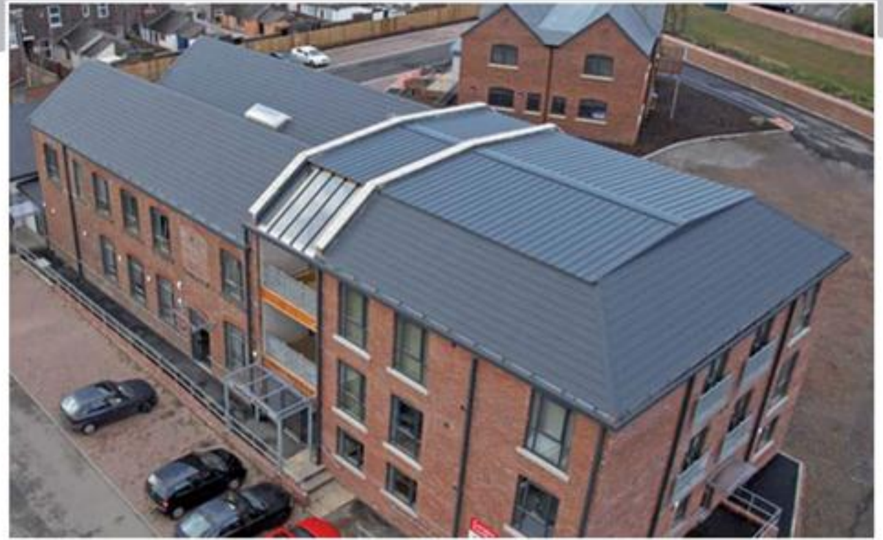
Above: Telford House, Riverside View, Carlisle. Meta-SlatePlus roofing system to a conversion of an existing building.

The screws are fixed through the overlap between panels so that the screw is driven through two thicknesses of the metal top sheet (fixed at a maximum of one per metre of panel length). The frequency of fixing can be increased around the edges of the installation or where special detailing is required.