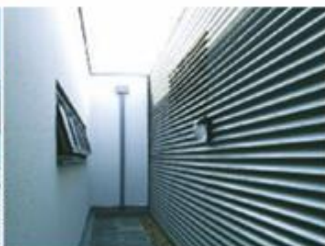
APL Louvres – live louvres and matching louvres profiles compatible with all APL products