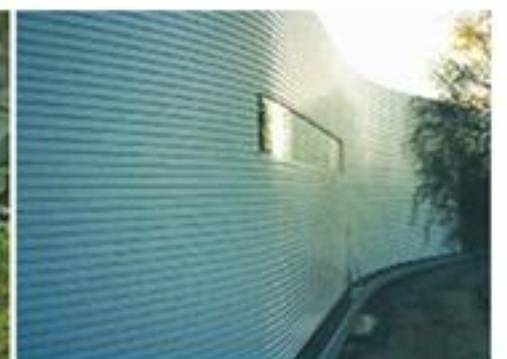
APL Trapezoidal – vertical or horizontal. Style with economy