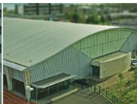
APL Roof Profiles – large profile range. AP65 zip seam standing seam system, on-site rolled or sheet delivered