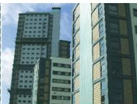
APL Rainscreen Systems – APL CPS secret fix and other flat panel systems – in any colour