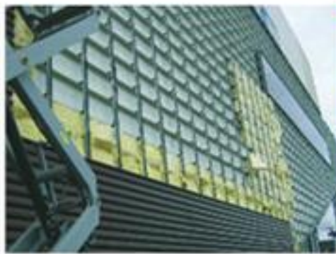
APL StrongBak™ – the most cost-efficient SFS system – the quickest complete closure and airseal of a building