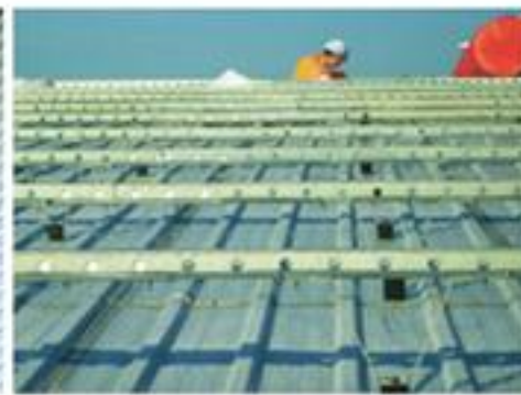
APL Tritherm™ cavity spacer system – unique flexibility for installing profile and/or rainscreen. For roofs and walls