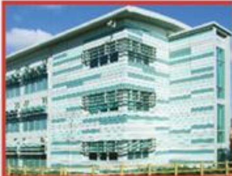
APL Energi™ Rainscreen Systems – cost-efficient, energy-saving with design versatility/flexibility