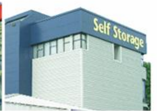
APL Retrofit Systems – cladding solutions for existing buildings for the entire envelope to meet the most rigorous current performance criteria